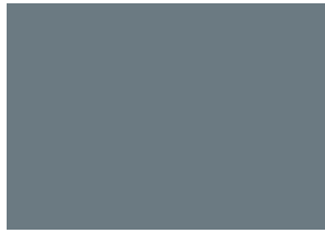
A89 Blue Smoke