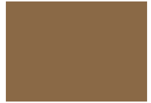
A55 Pecan Tan