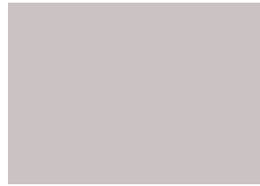
A78 Stone Gray