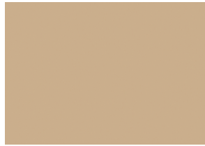
P24 French Cream