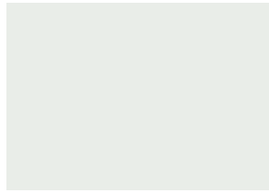
A72 Ash White