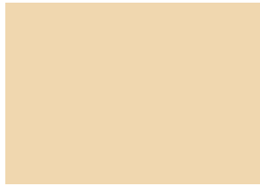
A52 Burberry Beige