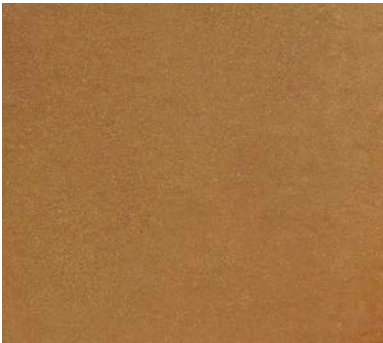
CS-2 Padre Brown