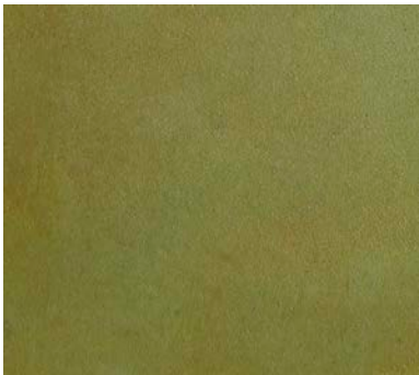
CS-12 Weathered Bronze*