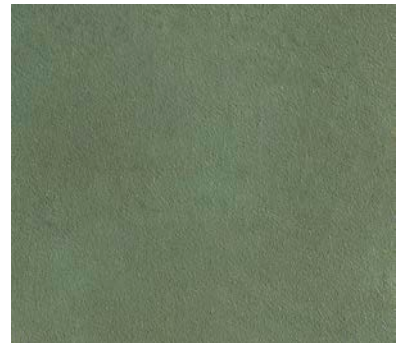
CS-13 Copper Patina*