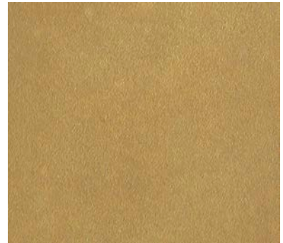
CS-15 Antique Amber