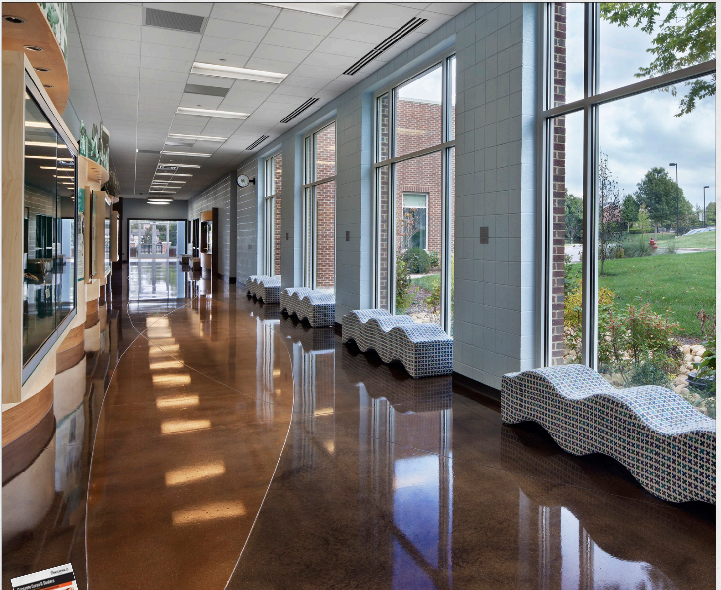
Harpeth Hall Athletic Center