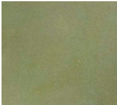
CS-11 Fern Green*