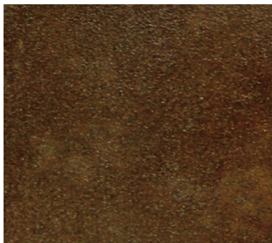
CS-14 Dark Walnut