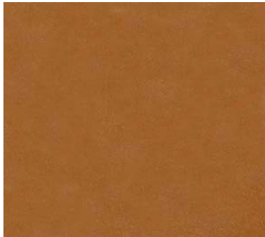
CS-16 Faded Terracotta